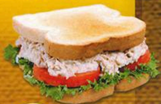
B13 Tuna Bread 金槍魚面包 RM7.50