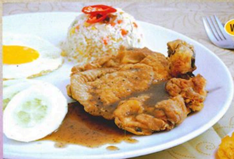
W01 CHICKEN CHOP 特式雞扒

Western cuisine, is a generalised term collectively referring to the cuisines of Western countries.