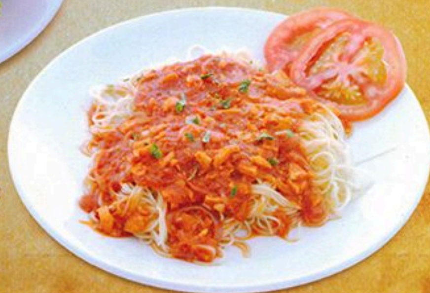
W04 CHICKEN SPAGHETTI 雞肉意大利面條 RM 13.90