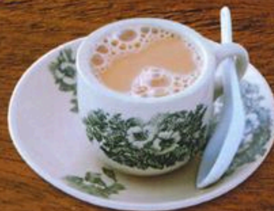
Hainam Cham 海南參