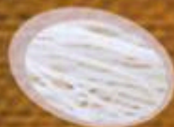
Rice Noodles 米粉