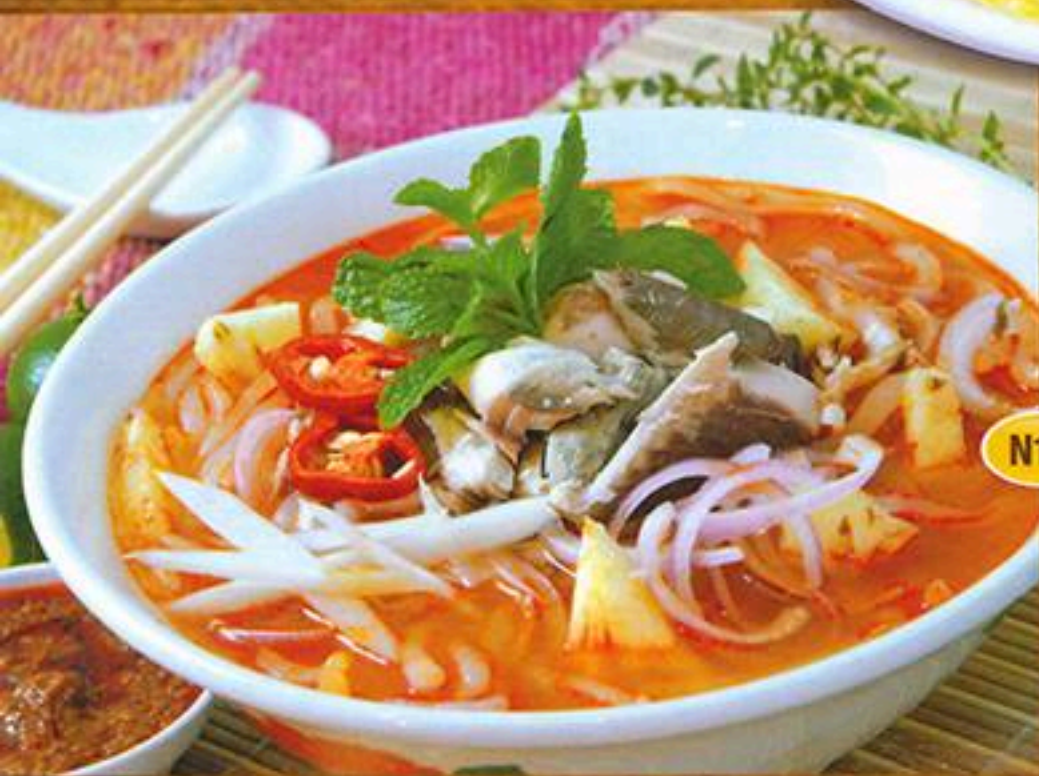
N10 Asam Laksa 亞三叻沙

Thick rice noodles served in aromatic fish-based tamarind broth with shredded pineapple, lettuce, red chili, cucumber, onion, galangal (curry flower) and lemon grass. Topped with shrimp paste and mint.