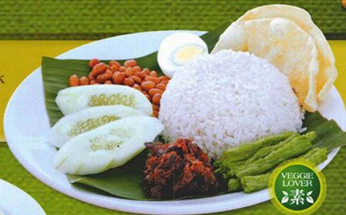
V01 Vegetarian Nasi Lemak 素椰漿飯 RM9.90