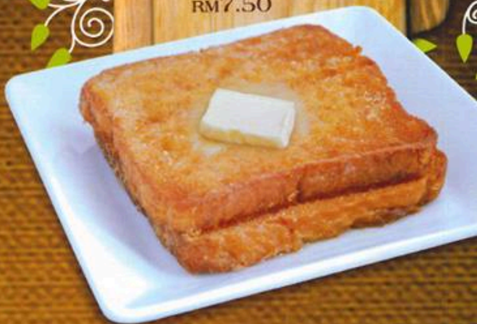
B22 French Toast 法式吐司面包 RM7.50