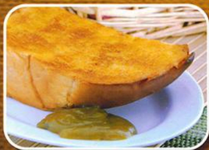
Roti Kulit with Margarine & Kaya 炭烧面皮+菜油与加央