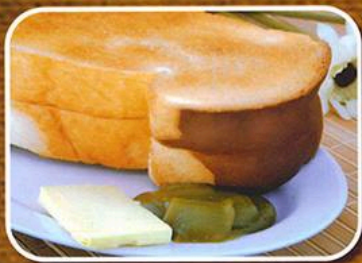
Roti Bakar with Butter & Kaya 炭烧面包+牛油与加央