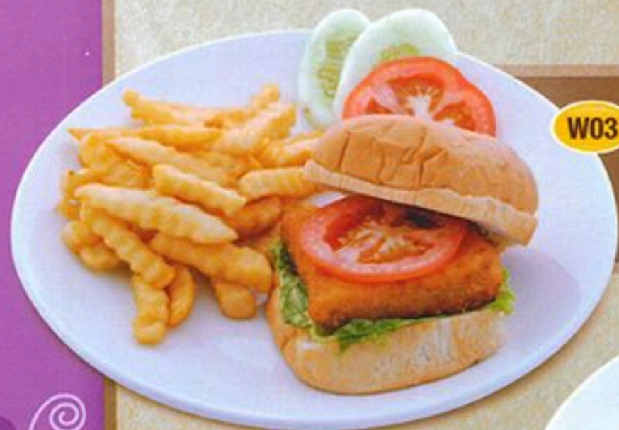
W03 FISH BURGER 魚肉漢堡

Deep fried battered fish patty; accompanied with tomato, seeded bun & fried potato strips, sliced cucumber and tomato.