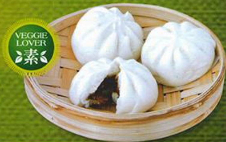
V03 Steamed Vegetarian Char Siu Pao 蒸素叉燒包 (3 pieces/ 三粒) RM6.50