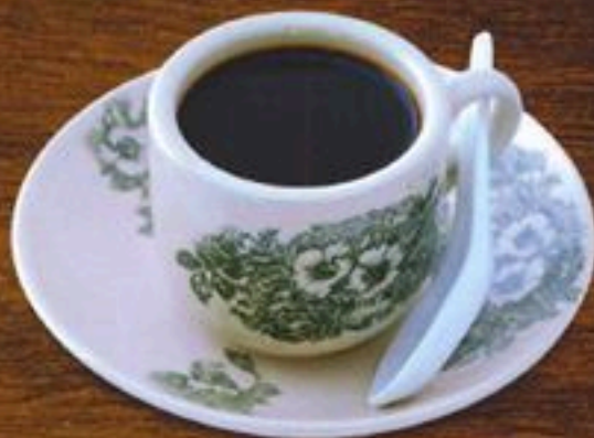
Kopi O 咖啡烏