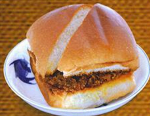
Toast Bun With Roasted Coconut 烘圓包+黑糖椰絲