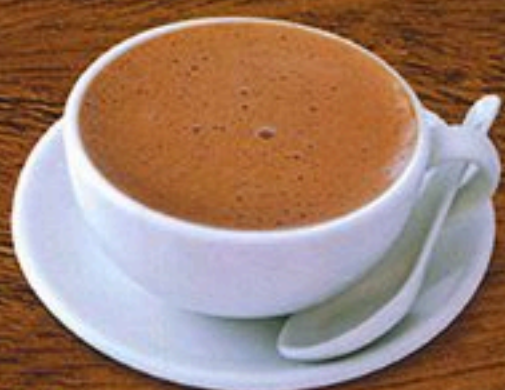
T29 Kopi Cham Milo 咖啡+麥+美祿 RM4.70