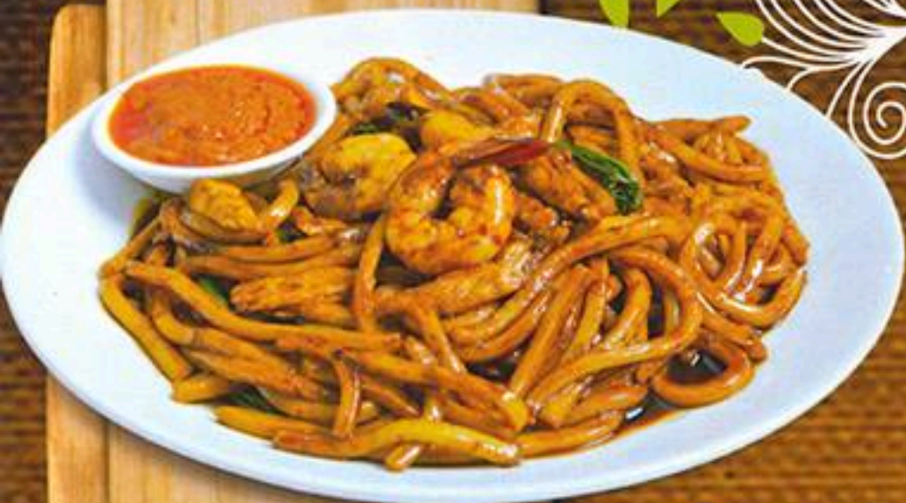
N08 Hokkien Mee 福建面 RM 10.90