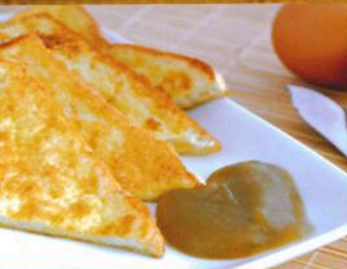
B23 Egg Toast 雞蛋吐司面包 RM7.50