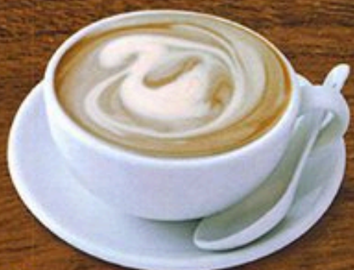
T30 CAPPUCINO 卡布其諾 RM6.00