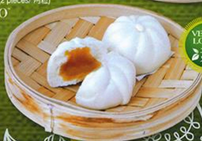
V04 Steamed Kaya Pao 加央包 (2 pieces/ 兩粒) RM6.50