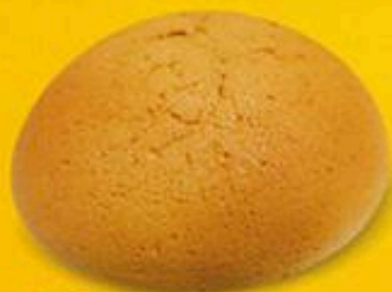
B12 Coffee Bun 咖啡面包 RM2.50