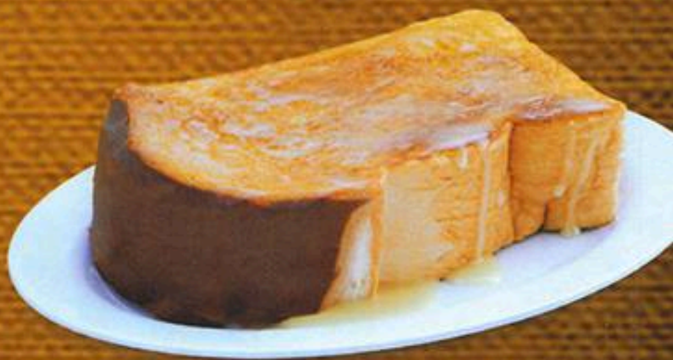
Roti Susu 牛奶面包