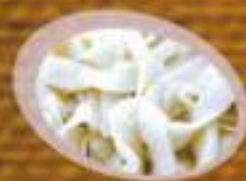
Stir-fried ricecake strips 粿條