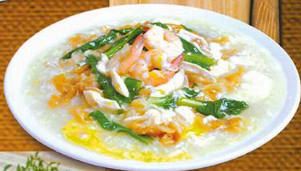
Wat Tan Hor 滑蛋河 RM 11.90