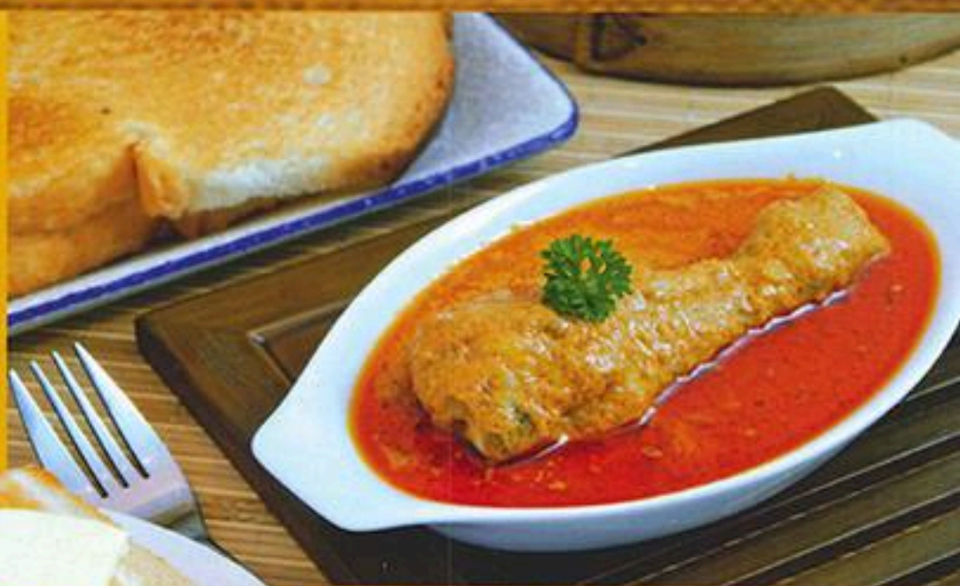
B17 American Breakfast 美式早餐 RM7.90