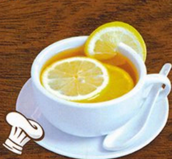
Detox Tea With Honey 蜂蜜排毒茶

a blend of 7 herbs; helps burn fat & boots metabolism with antioxidants.