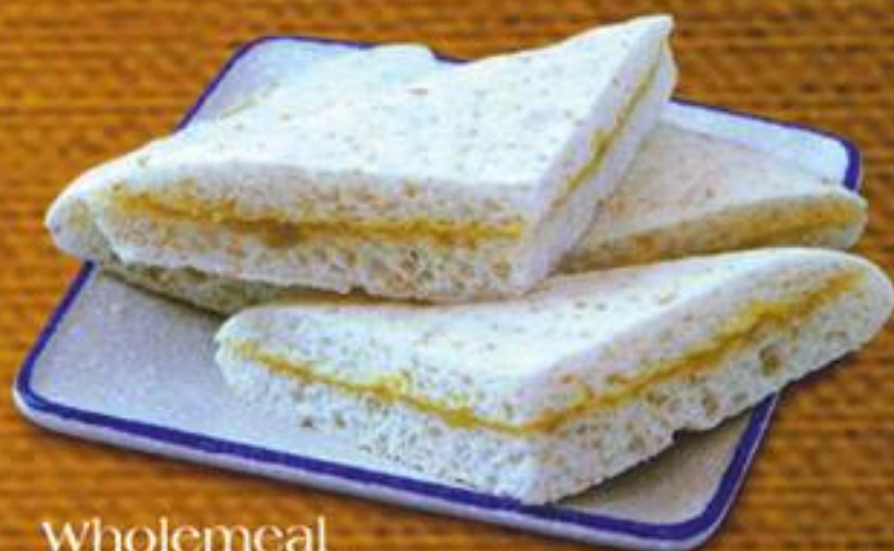
Wholemeal With Margarine & Kaya 全麥面包+菜油与加央