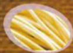
Yellow Noodles 面