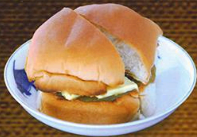
Toast Bun with Butter & Kaya 烘圓包+牛油与加央