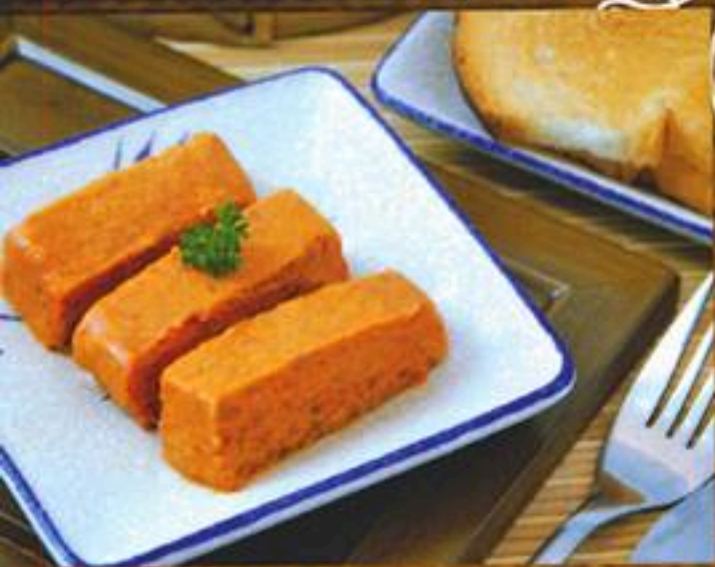
B21 Roti Bakar With Steamed Fish Otak-otak 炭燒面包+魚肉烏達烏達 Single Bread/ 一片面包 RM7.50