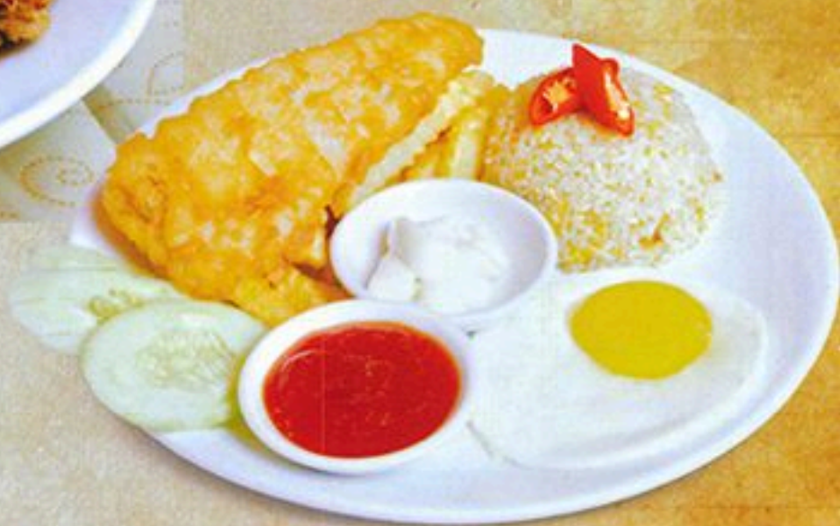
W02 FISH & CHIPS 特式魚扒

Fish fillet deep fried in batter; served with fried potato strips, accompanied by fried egg and fried rice.